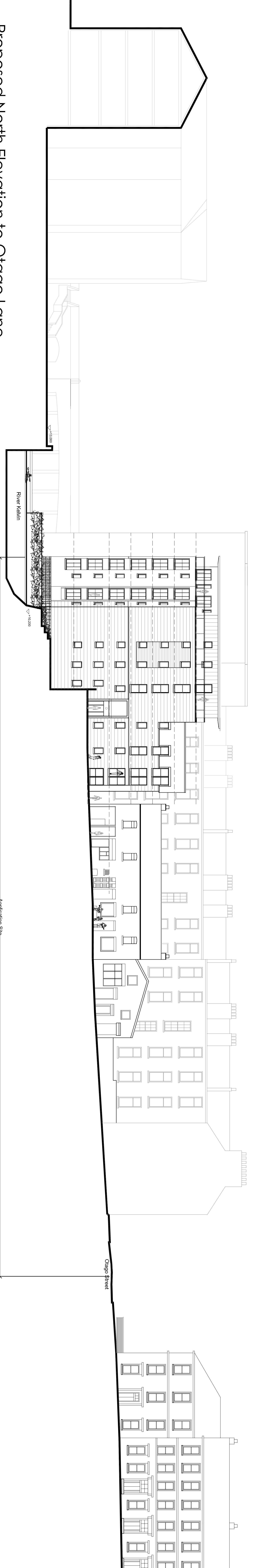
Proposed North Elevation to Otago Lane