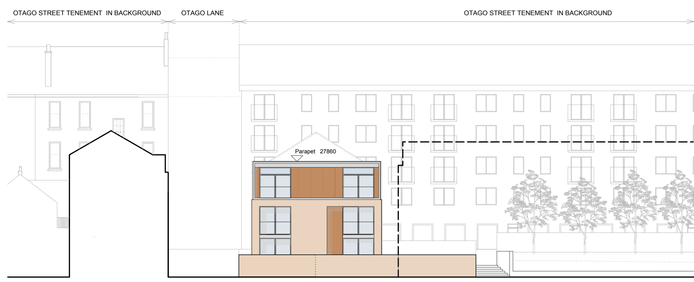
3 East Elevation Scale 1:200