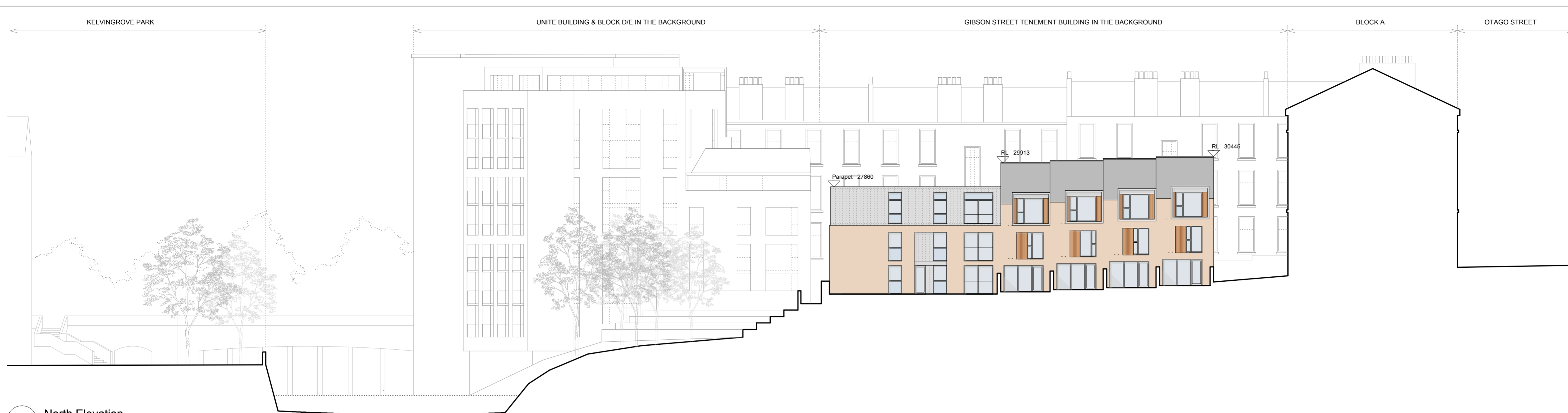
1 North Elevation Scale 1:200