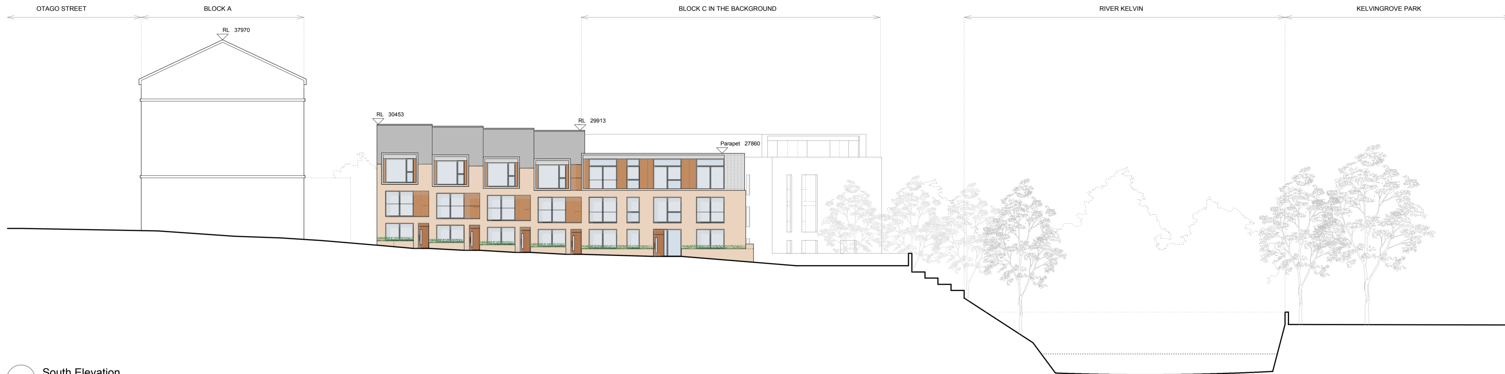
2 South Elevation Scale 1:200